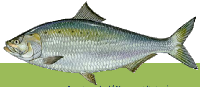
American shad ( Alosa sapidissima )